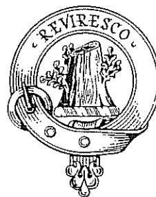
House of Bardrochat