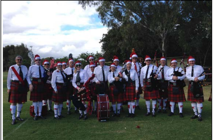
The Royal Caledonian Society Pipe Band in their kilts but instead of Feather bonnets, Father Christmas hats. They have performed in 6 pageants again this year.