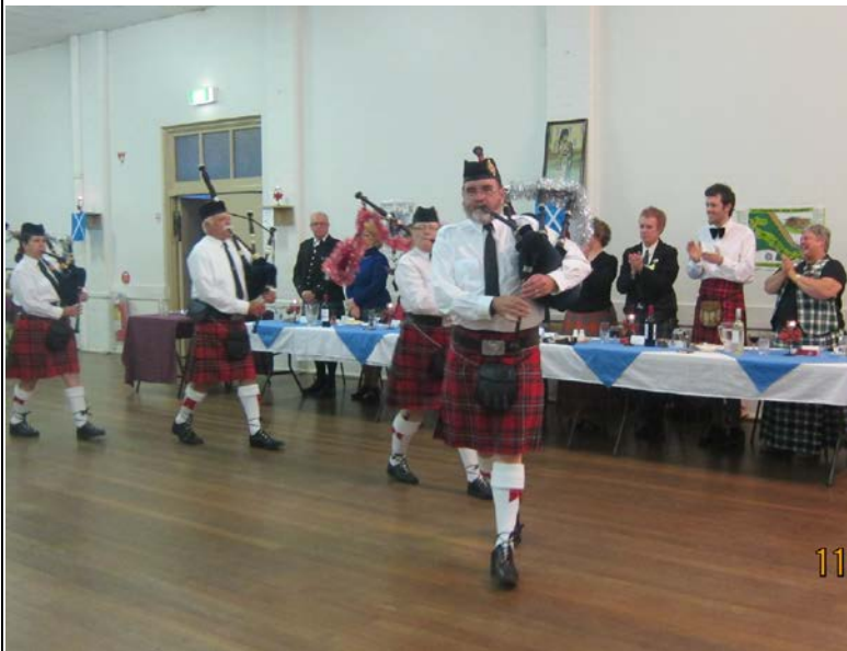
The Societies Pipes and Drums performed twice during the evening. Guests at main table standing in appreciation.

ST ANDREWS SUPPER HELD PAYNEHAM MASONIC HALL MARDEN ON 23 rd NOVEMBER 2013