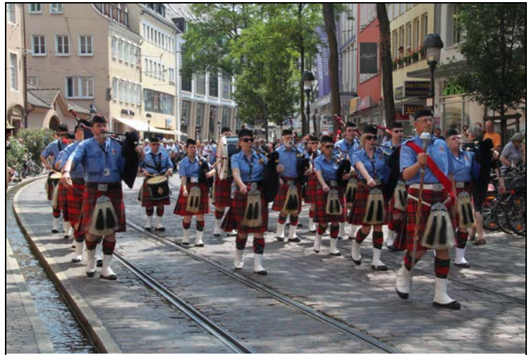
A photo from the bands visit to the Basel Tattoo in Switzerland. You think it would be cold but it was very hot.

The large oak library cupboard has now also been donated to the College for the collection to be stored in.